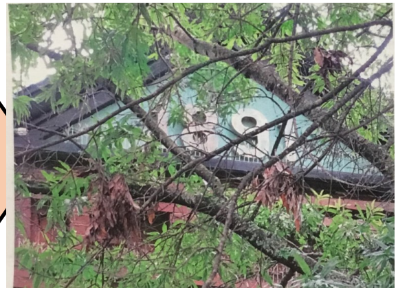
Bonus Photo Two