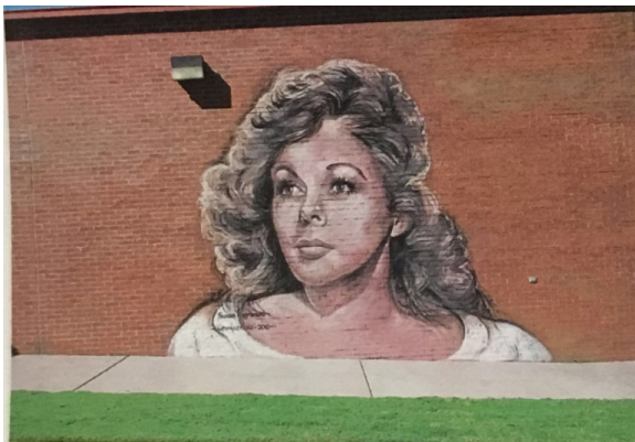
Bonus Photo One