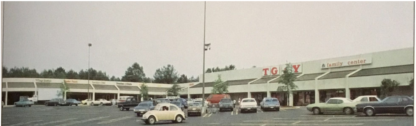
Picture it: First Tuesday Mall on Bankhead Highway from a brochure published by the Carroll County Chamber of Commerce in 1982. Do you remember the other stores in the shopping Center?

If you are thinking about the legacy you want to leave, please consider the Carroll County Historical Society or one of its on-going projects as an option. Including the CCHS in your estate planning is an easy way to make a lasting impact for the preservation of local history and traditions you value. Visit Carroll County Historical Society's on-line gift planning to learn how to make CCHS a beneficiary of your will, trust, life insurance policy, or retirement plan. Any amount will be greatly appreciated and will enable the Society to preserve our heritage for future generations. Learn more details by emailing us at cchsorders@carrollcountyhistory.org —or by visiting www.carrollcountyhistory.org .