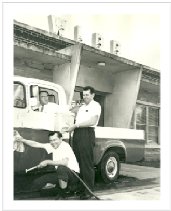
The First Radio Station in West Georgia WLBB, AM 1330