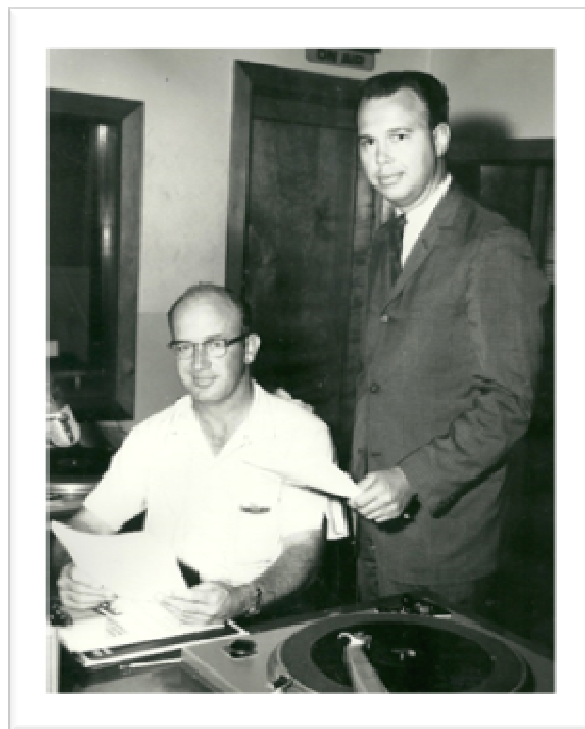
Everyone Listens to the Radio

WLBB is still on the air, along with six other stations in the West Georgia and East Alabama area is now owned by Gradick Communication.