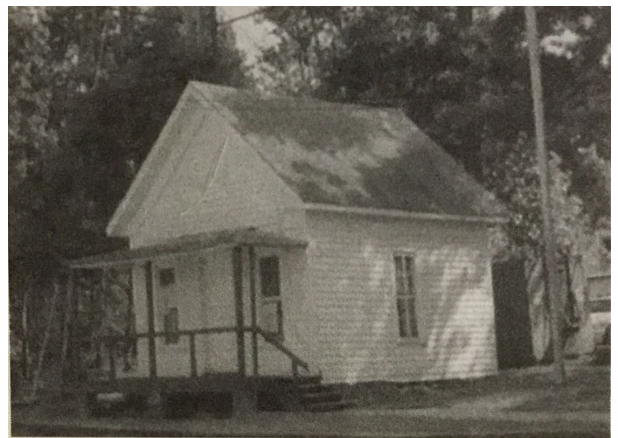
First Mt. Zion City Hall built in 1907 as seminary library