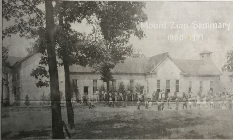
The Mount Zion Seminary opened its doors in 1880, and was the forerunner of the modern Mt. Zion schools, making them the oldest schools in continuous operation in Carroll County.