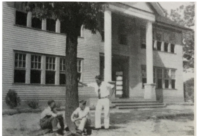
Mt. Zion Seminary Academic Building 1935