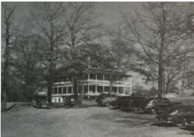
Fuller Hall - Boys Dormitory 1882-1937