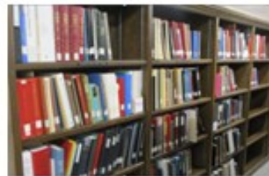
Local Family History Books

Guides you as you flip through Genealogy books searching for your Ancestors. Resources in the Local History Room.