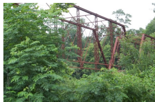
Photos of Moore's Bridge and house, from the Watkins Collection

Next Month we will "celebrate" the resurgent of the Carroll County Historical Society from the Covid Epidemic.