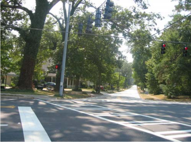
Entrance to Residential Longview Street