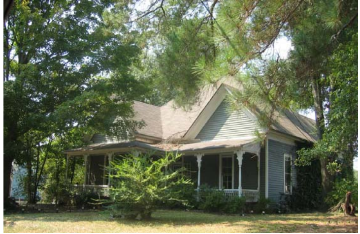
Future Gravel Parking Lot?